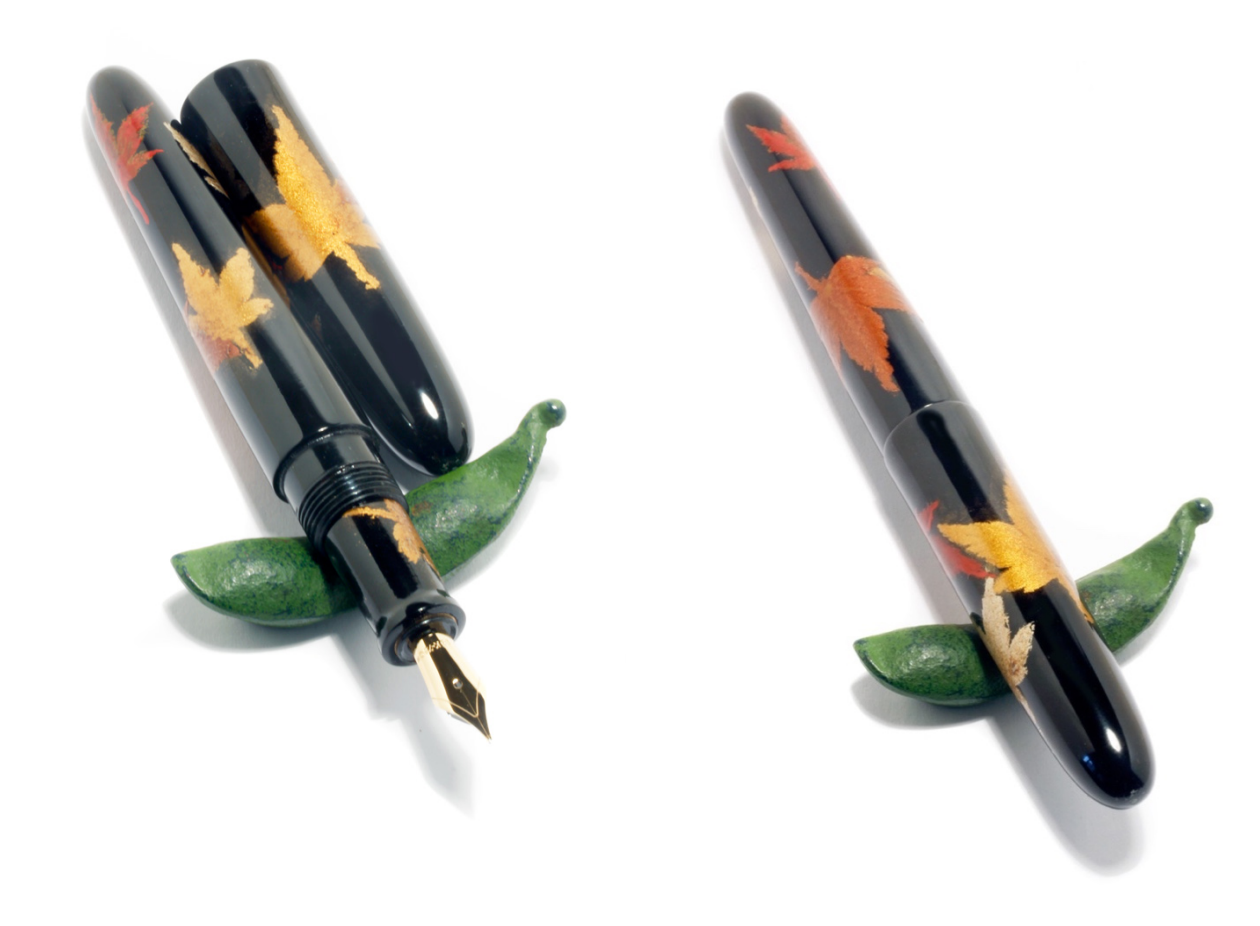
#5-5 Momiji Maaki-e