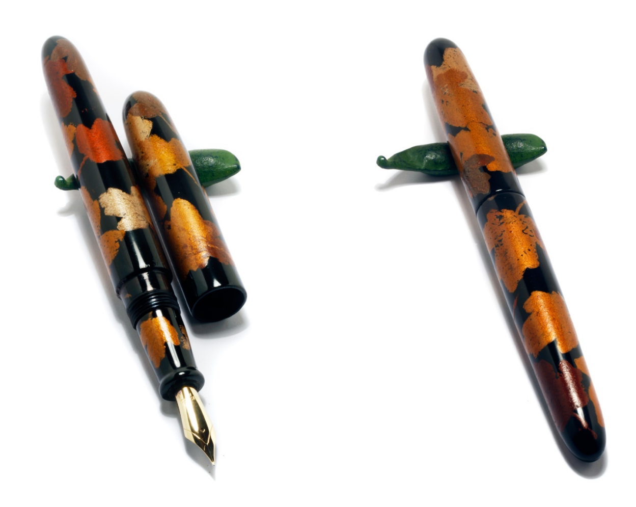
#5-3 Hedge Maple Momiji Maki-e