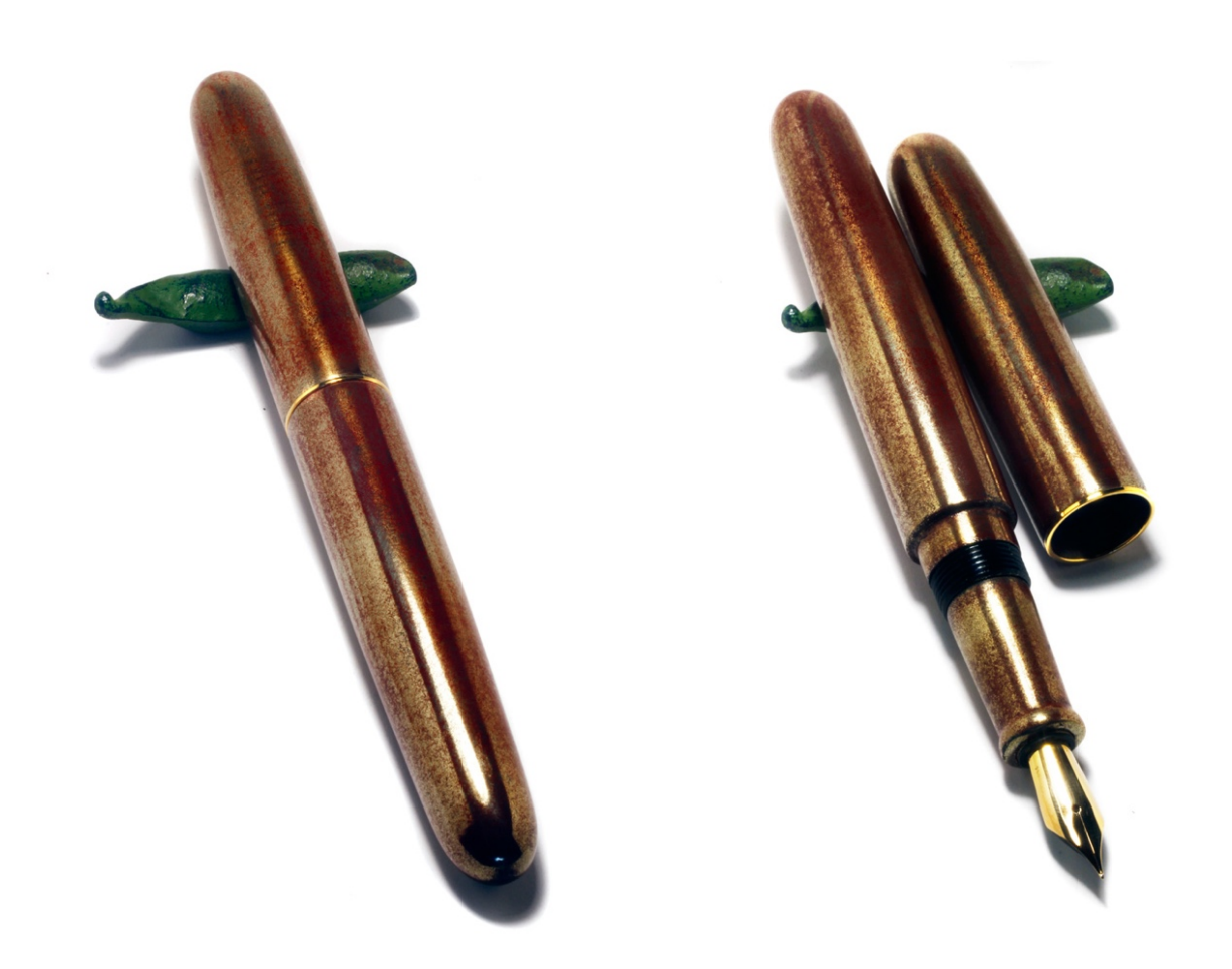
#5-11 Aka Kin Nuri Red Gold Lacquer