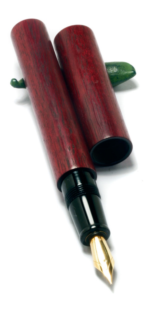
#5-15 Pink Wood exotic wood with Fuki Urushi treatment