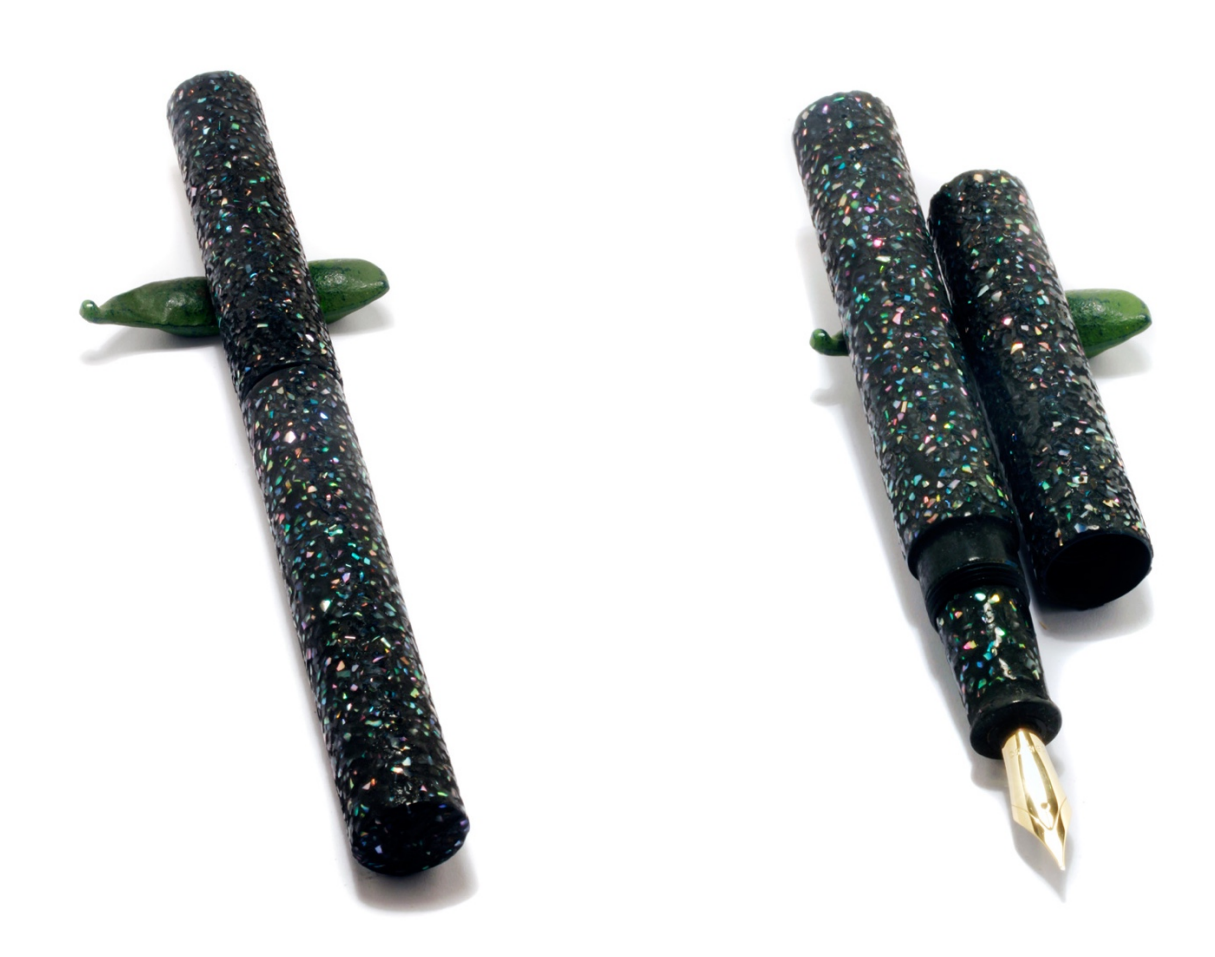
#5-9 Raden Ishime-Ji Stone surface with Raden