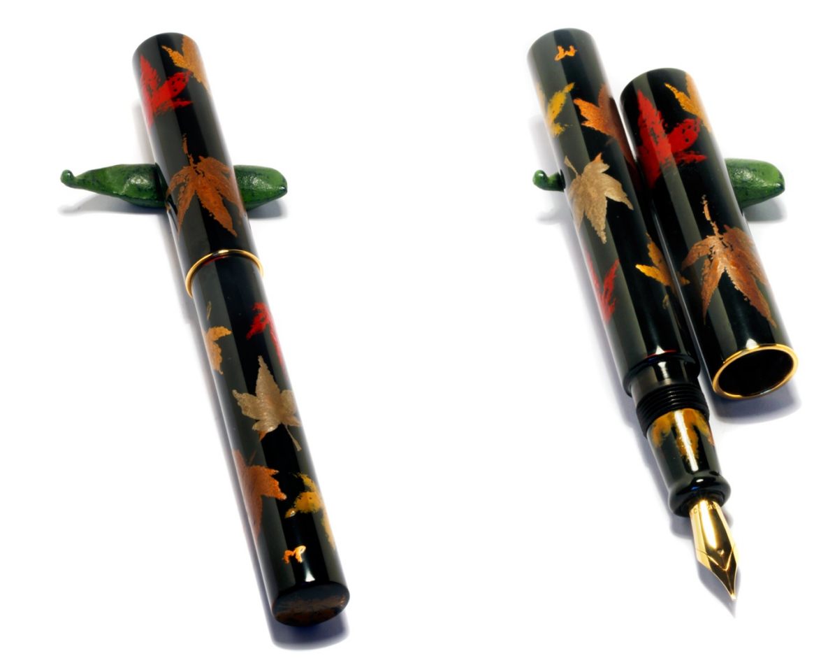
#5-7 Momiji Maki-e