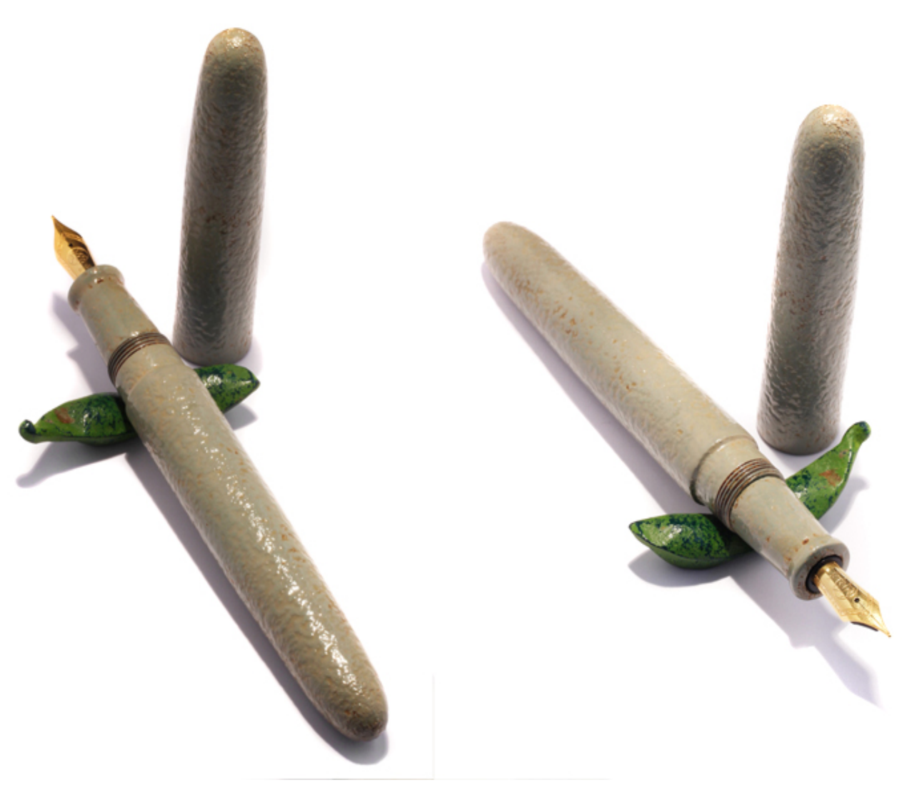
#5-2 Zôge Ishime-Ji Ivory color Stone Surface