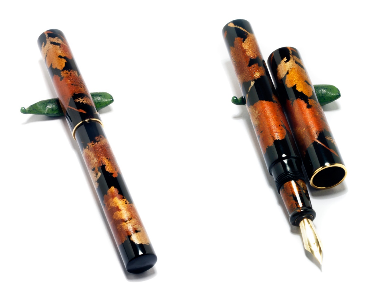
#5-6 Oak Leaf Maki-e