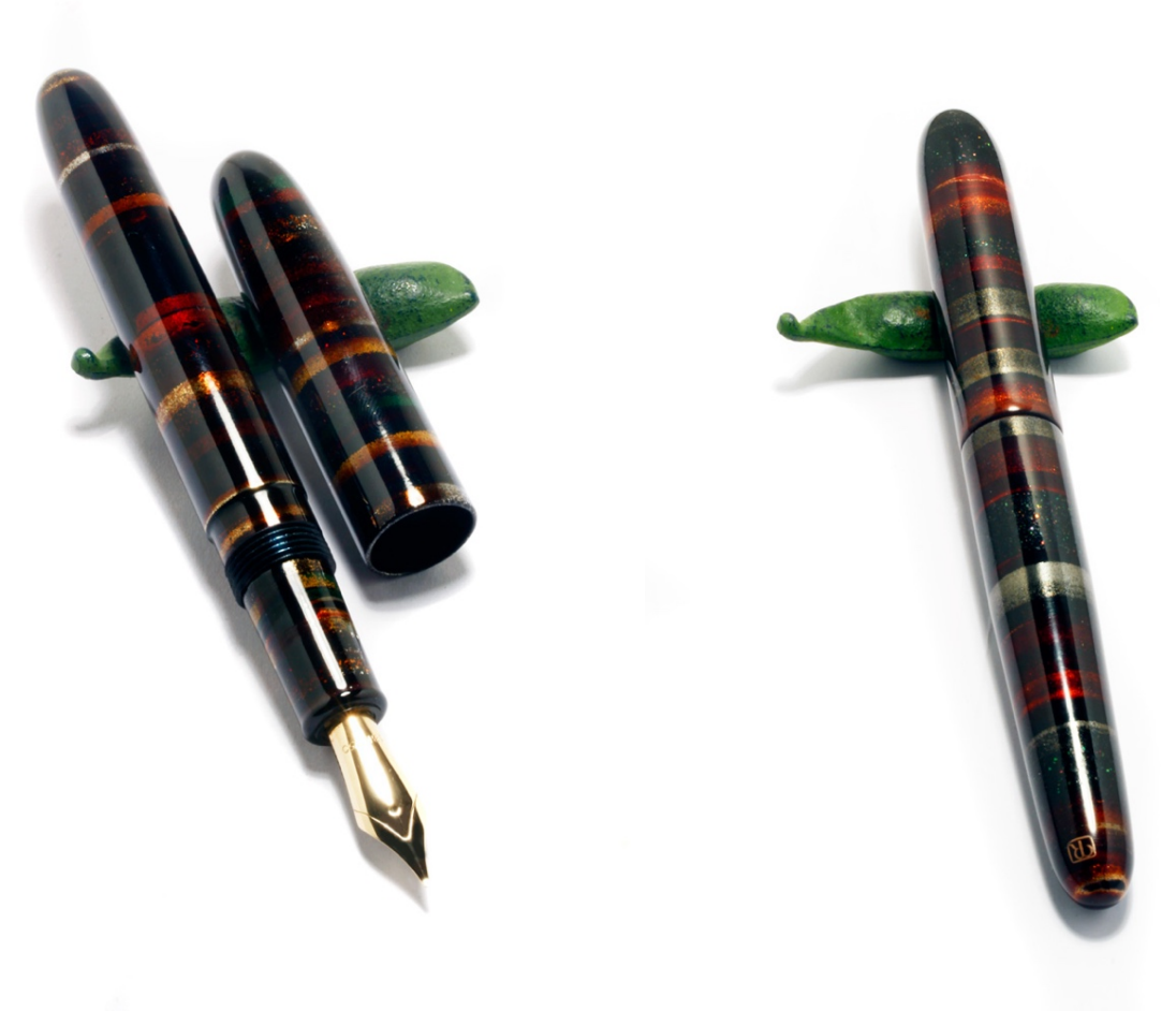
#5-4 Namban Kawarinuri