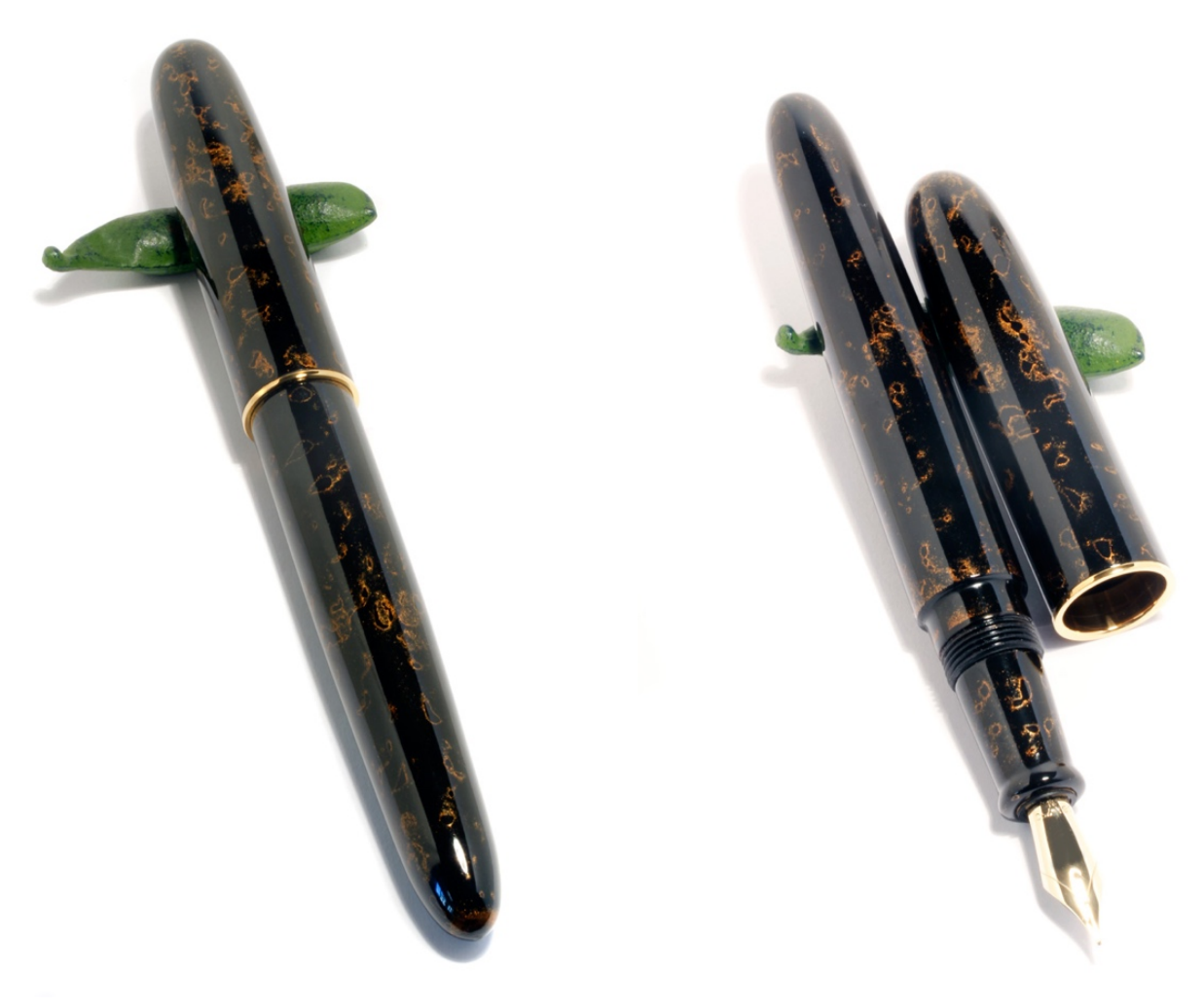
#5-13 Tsugaru Nuri