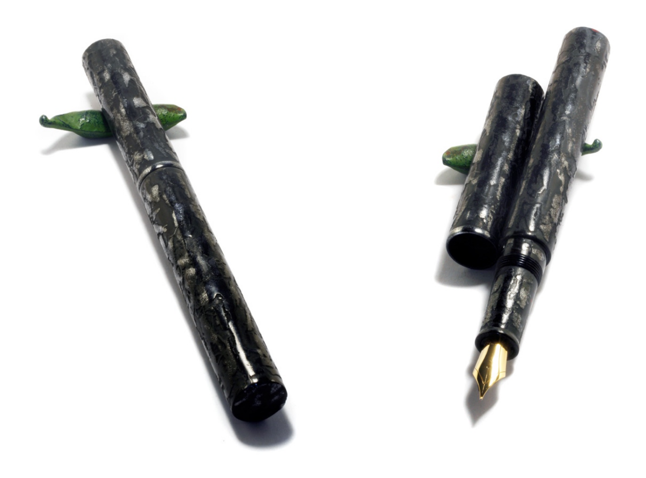
#5-8 Inseki Nuri Meteorite Lacquer