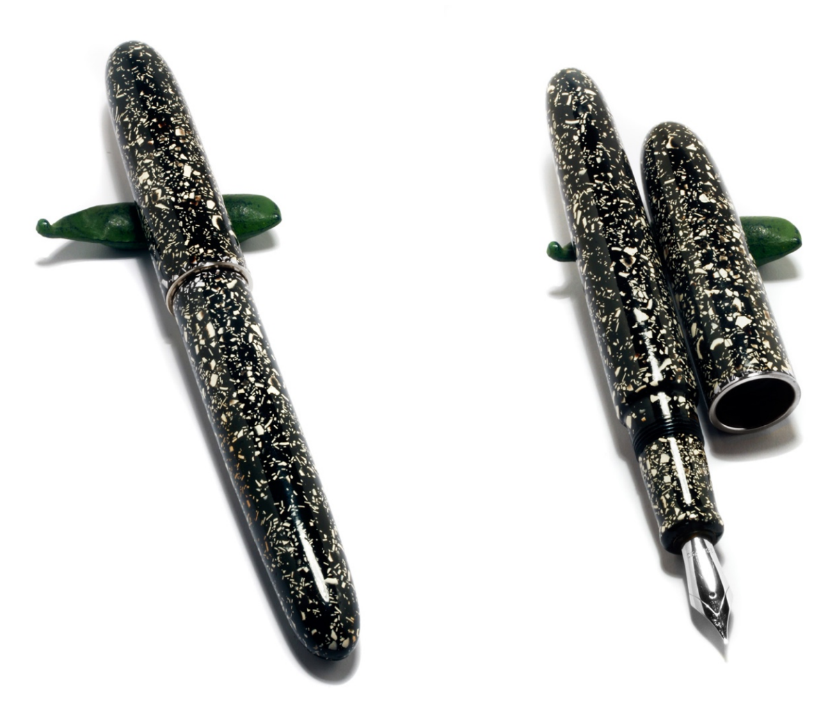
#5-12 Rankaku Fubuki Nuri Egg Shell