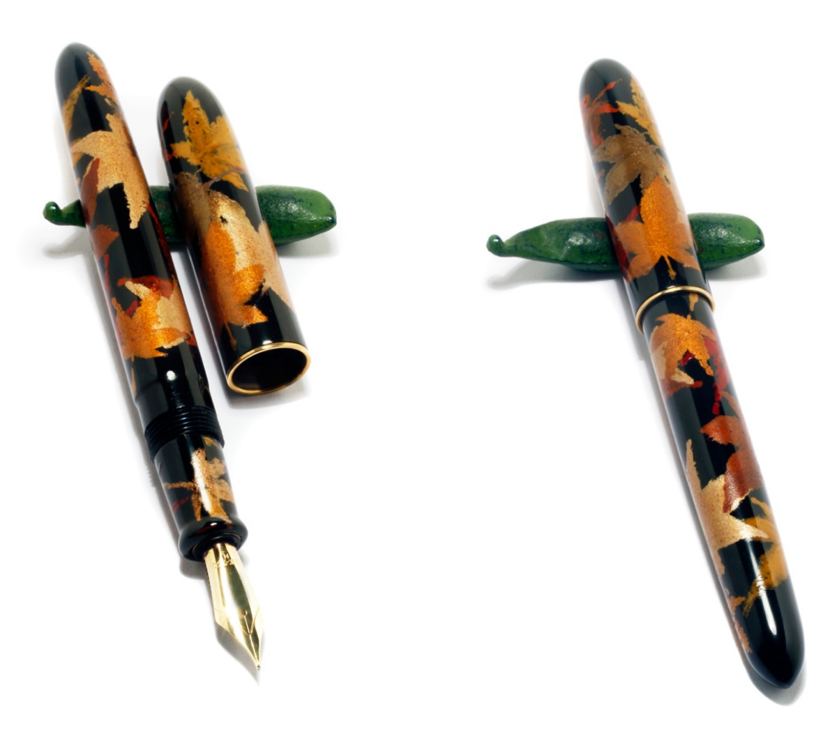
#5-10 Momiji Maki-e