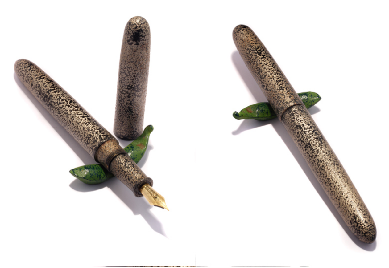
#5-1 Gin Ishime-Ji Silver Stone Surface